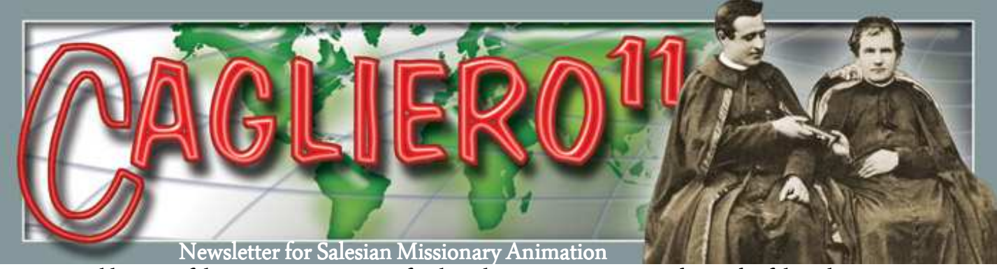
A Publication of the Mission Department for the Salesian Communities and Friends of the Salesian Mission

he proclamation of the Gospel is made effective, with the grace of God, when it is accompanied by prayer. So, the primary prerequisite of the mission is the mission-